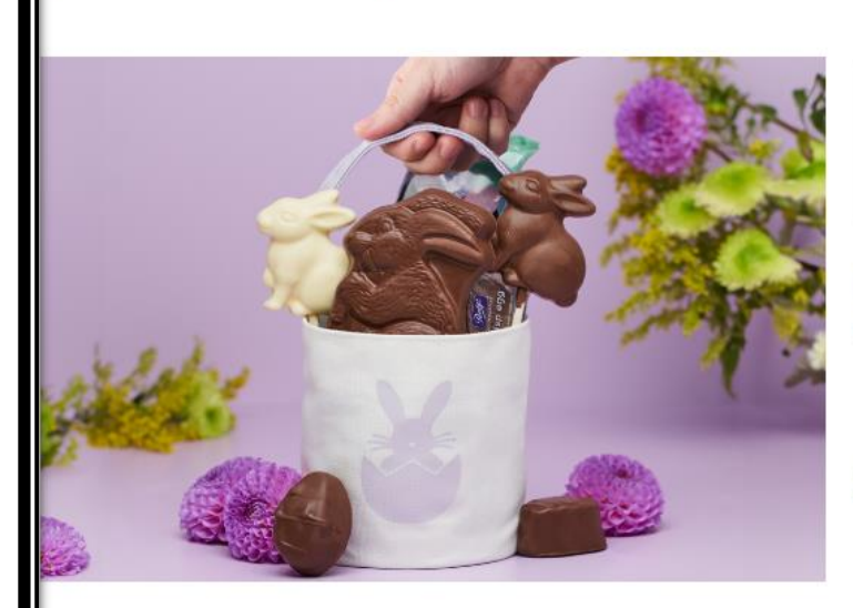
The St. Mary's School Community Council (SCC) raise money to help our school achieve their goals. We fund reading, math, outdoor fun, family wellness and nutrition programs in our school. Please purchase this premium quality chocolate for Easter! Sell to your friends and family!