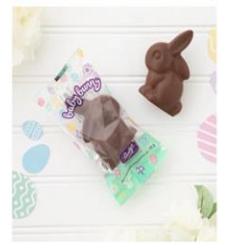
Baby Bunny - Milk $6.25