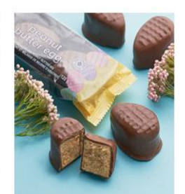
Peanut Butter Eggs $7.25