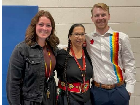
Teachers from St. Mary's School